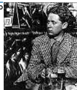
Dylan Thomas in the USA

November: continues work on Under Milk Wood .