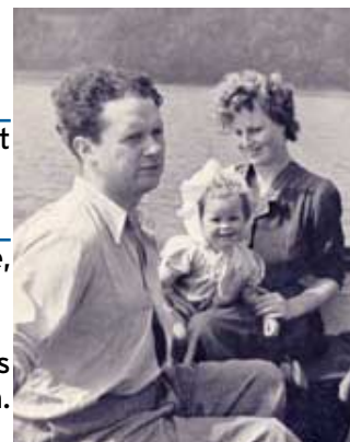
Dylan, Caitlin and Aeronwy, Laugharne 1943