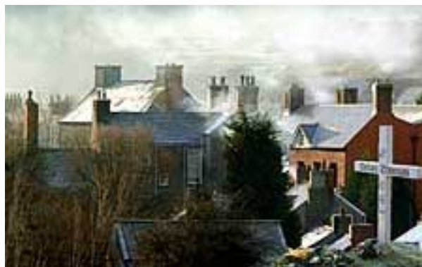
Dylan Thomas' Grave St. Martin's Church, Laugharne

10 Aug: interred in Dylan's grave at Laugharne.